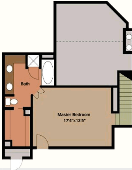
B2 2 BED/2 BATH - 1,167 Sq.