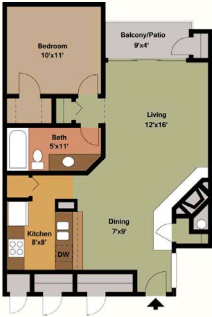
A1 1 BED/1 BATH - 657 Sq. Ft.*