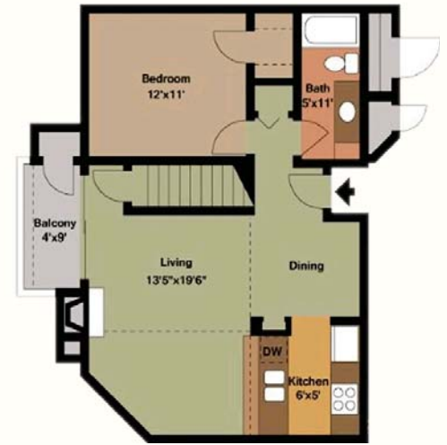
B1 2 BED/1 BATH - 1,145 Sq. Ft.*